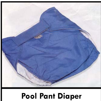
Pool Pant Diaper

We found this item in the Abilitations Catalog and thought some families might be interested. The Pool Pant Diaper, for both big kids and adults, has an outer layer of oxford nylon and an inner layer of 100% cotton flannelette. Special velcro closures allow for adjustability but prevent accidental opening with movement. The youth cost is $19.95 and the adult is $27.95. Call Abilitations at 1-800-850-8602 and request a catalog or visit them on the web at www.abilitations.com .