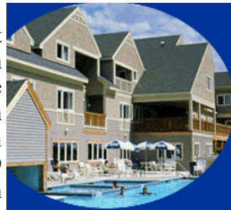
Grand Summit Hotel Attitash/Bear Peak

If you have never attended the conference please watch for information about next year's conference in the February 2002 newsletter. Please call if you have any questions at that time.