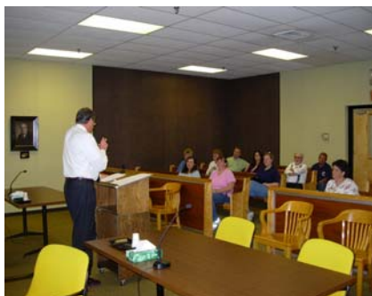
Parents attending a training on the Guardianship process.

These were excellent parent trainings, all parents could learn from them. a parent