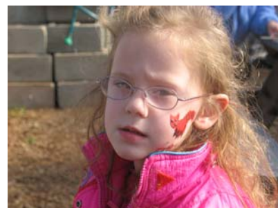
Face Painting, a corn maze, and other crafts were enjoyed by the kids.