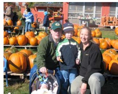
Over 100 family members attended this year's Hayride.