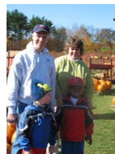
Everyone enjoyed the cider and pumpkin cookies. Hope to see you here next year.