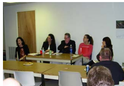
Parents learn about the adult service system from a panel of administrators of adult services .